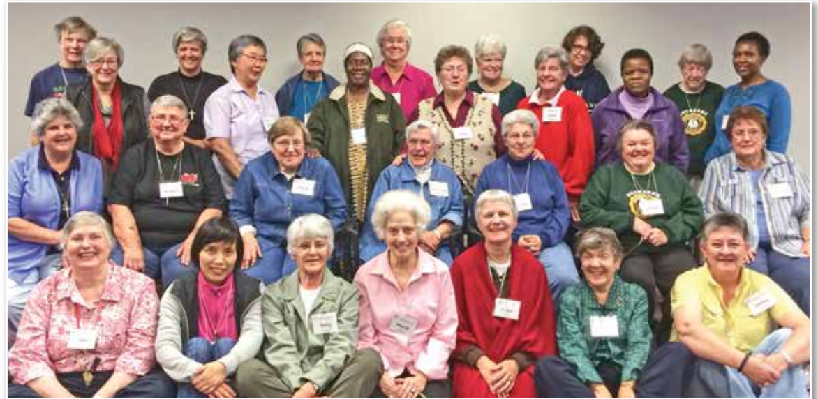
Prayer and Dialogue gathering in Houston