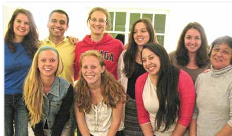
Jesuit Volunteers joined the Sophia House Community for dinner and prayer.