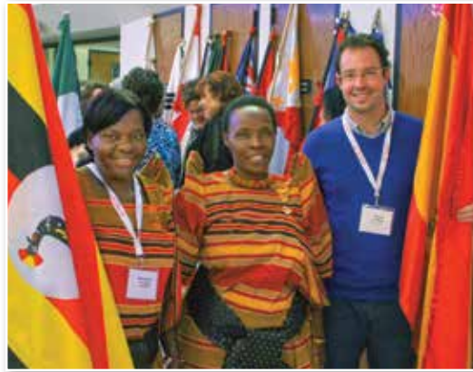
Flag bearers for the opening liturgy for the AMASC conference in Scottsdale in November.