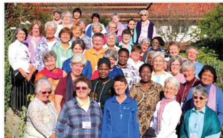
A special gathering of province members aged 65 and under.