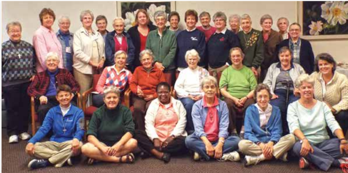
Prayer and Dialogue gathering in Belleville, Illinois