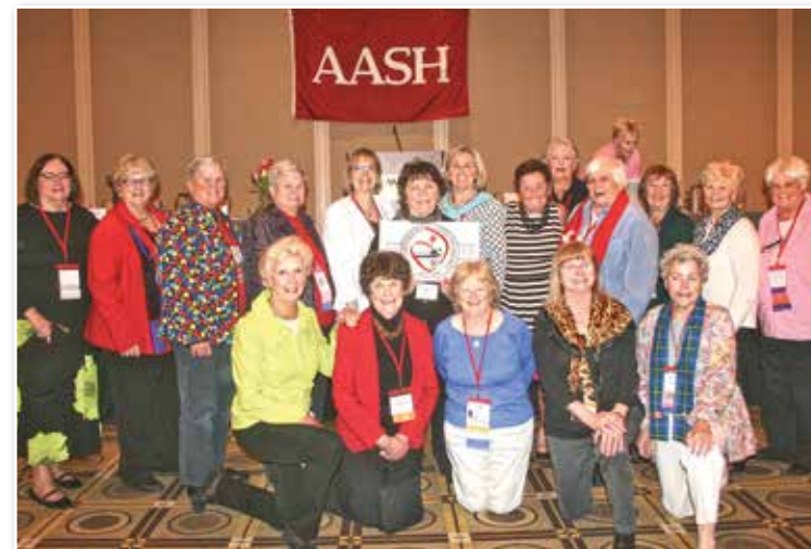
The planning committee for the AASH national conference held in April in Boston, with a theme of Philanthropy from the Heart .