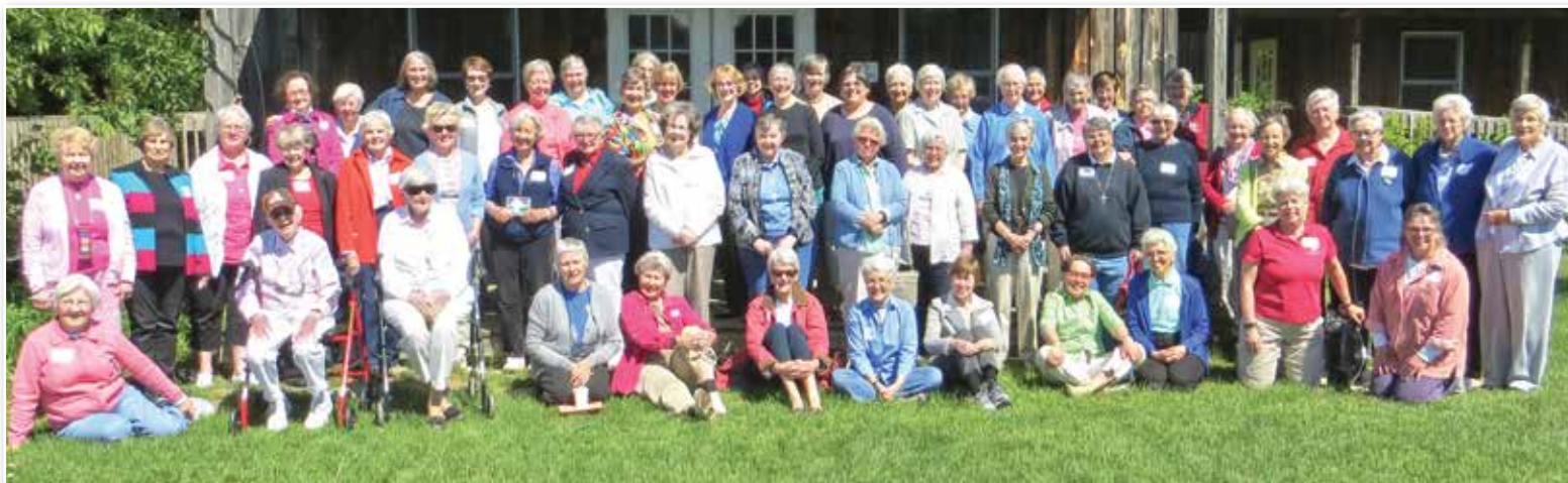
Religious of the Sacred Heart from throughout the province gathered with former RSCJ on the Feast of Saint Madeleine Sophie at Sprout Creek Farm.