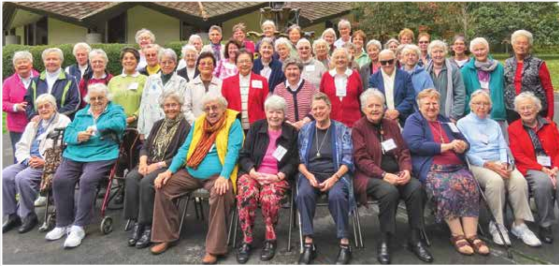
Prayer and Dialogue gathering in Menlo Park, California