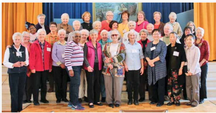
Religious of the Sacred Heart at the Prayer and Dialogue gathering in Montreal