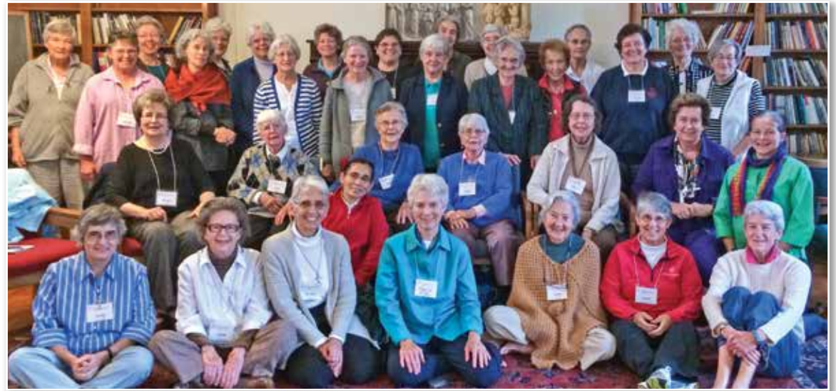
Prayer and Dialogue gathering in White Plains, New York