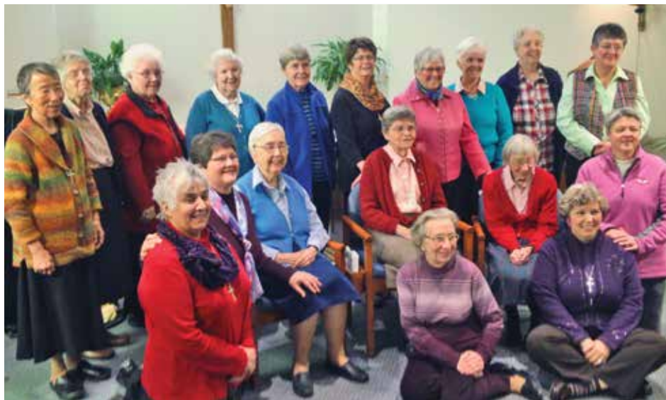
Canadian Religious of the Sacred Heart met in assembly in February. On July 8, they will unite with the United States Province.