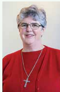
In One Heart,

Know that you can count on the prayer of the Religious of the Sacred Heart and we count on your prayer for us as we continue forward on this journey. May the spirit of the Risen Christ bring you and our world peace.