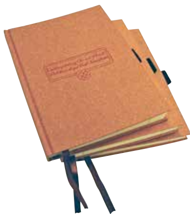
Journals distributed to the faculty, staff and board at Duchesne (Omaha) for personal reflection and contemplation.

We opted to focus our formation to mission as a more internal process rather than a list of events on the calendar. We came up with ideas for each of our constituency groups to have more opportunities for contemplation and reflection. We asked all adult members of our community to commit to a Little Club, a small group of adults who meet monthly or quarterly to reflect on what it means to contemplate Sacred Heart, and what it means to build transformative relationships. We distributed journals to the faculty, staff and board of trustees as an opportunity for personal reflection and contemplation. We issued “Life at the Sacred Heart” to our students and invited them to reflect on their experiences as children of the Sacred Heart within their advisory groups. We provided “A Reflection on Being a Sacred Heart