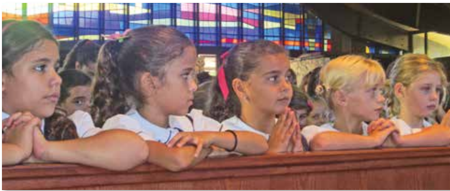
Students at Carrollton School of the Sacred Heart in the early stage of a lifelong habit.