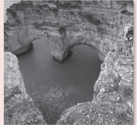
"Coisas da natureza" Marinha Beach, Allgarve, Portugal.

Heart is published two times a year to highlight the mission and ministries of the Society of the Sacred Heart, U.S. Province, for a wide circle of friends. The covers, photographs of hearts in nature, symbolic of Christ's presence at the heart of the universe, bear witness to the contemplative dimension of the Society's "wholly contemplative, wholly apostolic" mission: To discover and reveal God's love through the service of education.