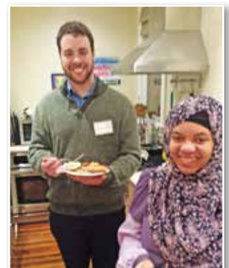
Young adults, including students from American University and Trinity University, attended a Muslim/Christian dialogue gathering at the Kearny Street community.