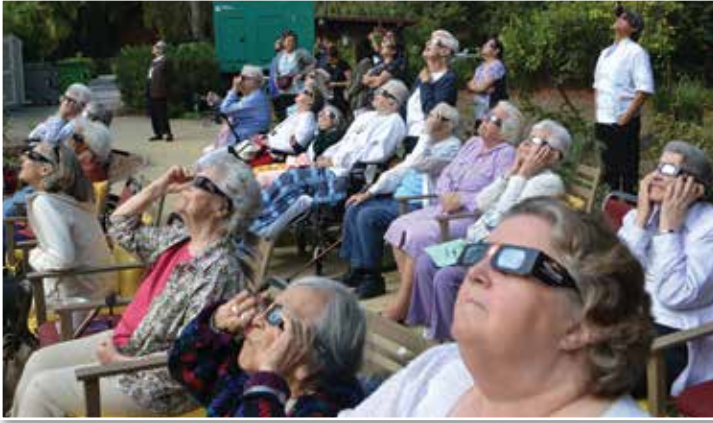
Oakwood residence and staff members gather together to experience the solar eclipse on August 21, 2017.