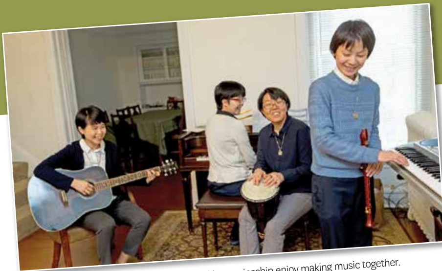
Novices from the international English-speaking noviceship enjoy making music together.