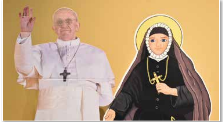
"Pope Francis" and "St. Philippine Duchesne" watch over the attendees at the Society's Spirituality Forum. Follow Flat Philippine at Facebook.com/vdoh1929.