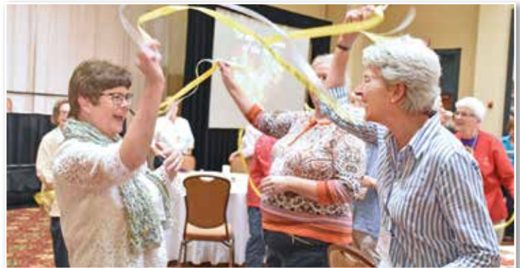
During part of one Assembly liturgy, the congregation wrote prayers on ribbons, which were then waved with joy at the offertory.