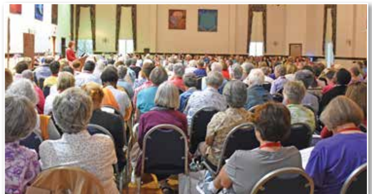
More than 300 attendees from 23 countries, including 148 RSCJ, participated in the Spirituality Forum.