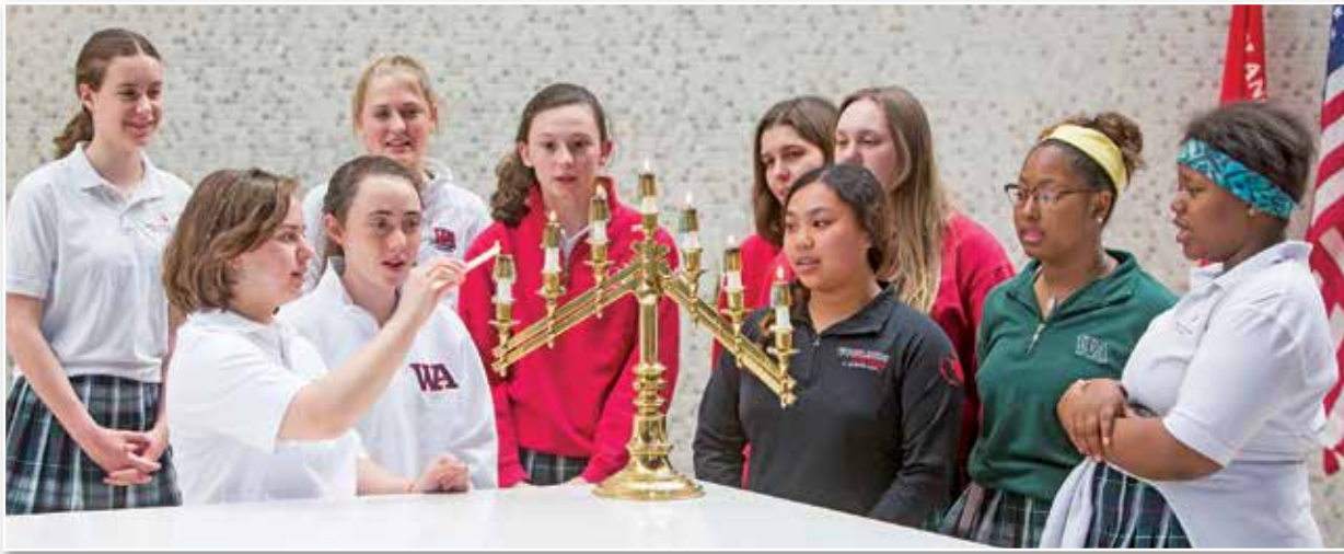
▲ Students of Woodlands Academy, Lake Forest, IL, prepare for chapel service.

To revitalize our unity in diversity and to act as one Body, dynamic, interconnected, linked with other bodies, in the world and as Church, in order to share, collaborate, and be in solidarity among ourselves and with others.