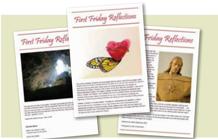
First Friday Reflections from the Society: an email prepared by an RSCJ, colleague or friend of the Society, with a reflection on the meaning of the Sacred Heart in our lives today. During the Bicentennial Year of Prayer (Nov. 18, 2017-Nov. 18, 2018) email reflections will be sent every Monday, beginning on November 20. The First Friday Reflections will be on hiatus during the Year of Prayer. Sign up to receive these reflections at www.rscj.org/connect .