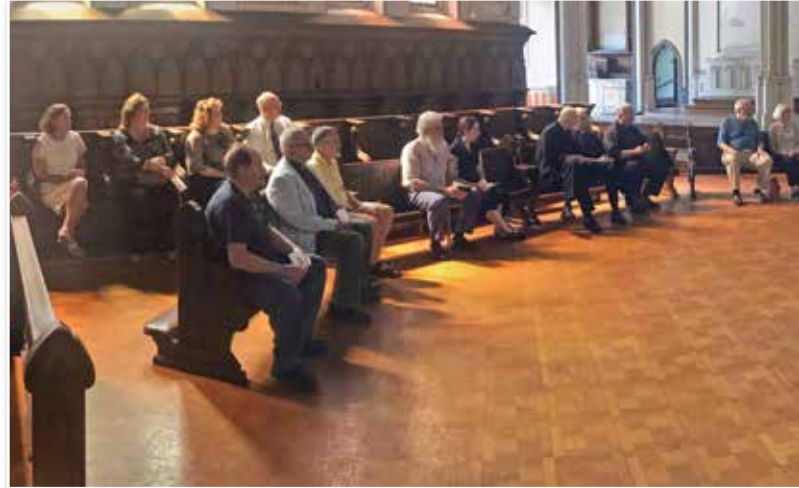
The Kenwood property in Albany, NY, owned by the Society since 1859, was sold on August 21, 2017. It served as a boarding and day school, noviceship, elder care facility, ecumenical house of prayer, child development center and Doane Stuart school. RSCJ, former RSCJ, alumni, associates, staff, past chaplains and friends gathered in the Chapel for prayer and sharing of memories.