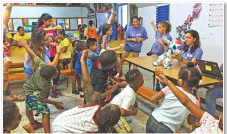
Carrollton School of the Sacred Heart, Miami, FL: In support of Sacred Heart Network Goals 3 and 5, students learned the features and limits of the NAO Humanoid robots and the ease with which the system can be used to introduce and integrate technology for marginalized, inner-city children.