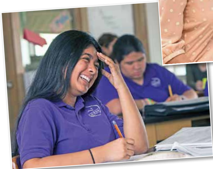
◀ Students in class at the Josephinum Academy of the Sacred Heart in Chicago