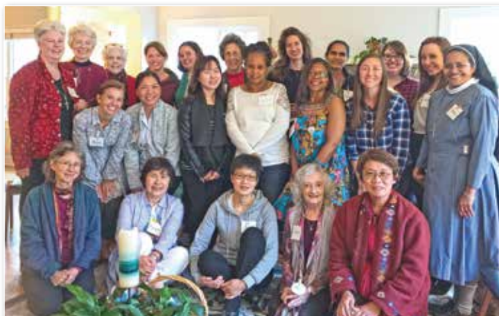
Prayer and potluck, Sophia House, February 2017

The mission of Sophia House, in Berkeley, CA, is to reach out to women and young adults in the greater San Francisco Bay Area. Currently, five RSCJ live in the community, and there is room for more. The community at Sophia House places an emphasis on simplicity of life, care for the environment, contemplation and community. Each member carries out her own ministry, but each has also committed herself to the shared ministry of the House.