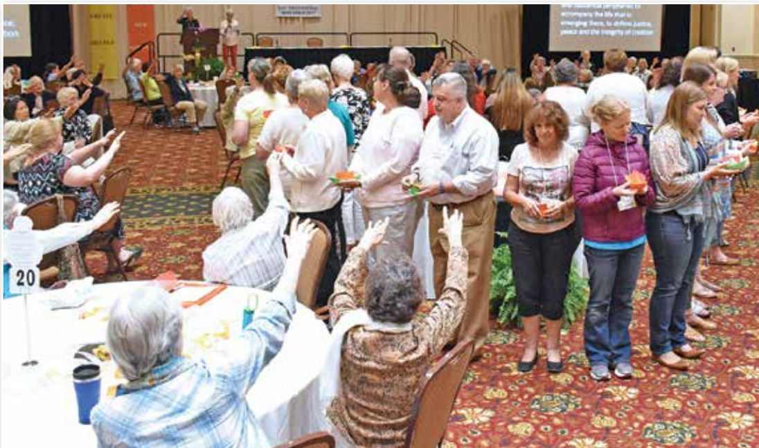
The RSCJ membership blessed our lay colleagues who attended the first three days of the Provincial Assembly.