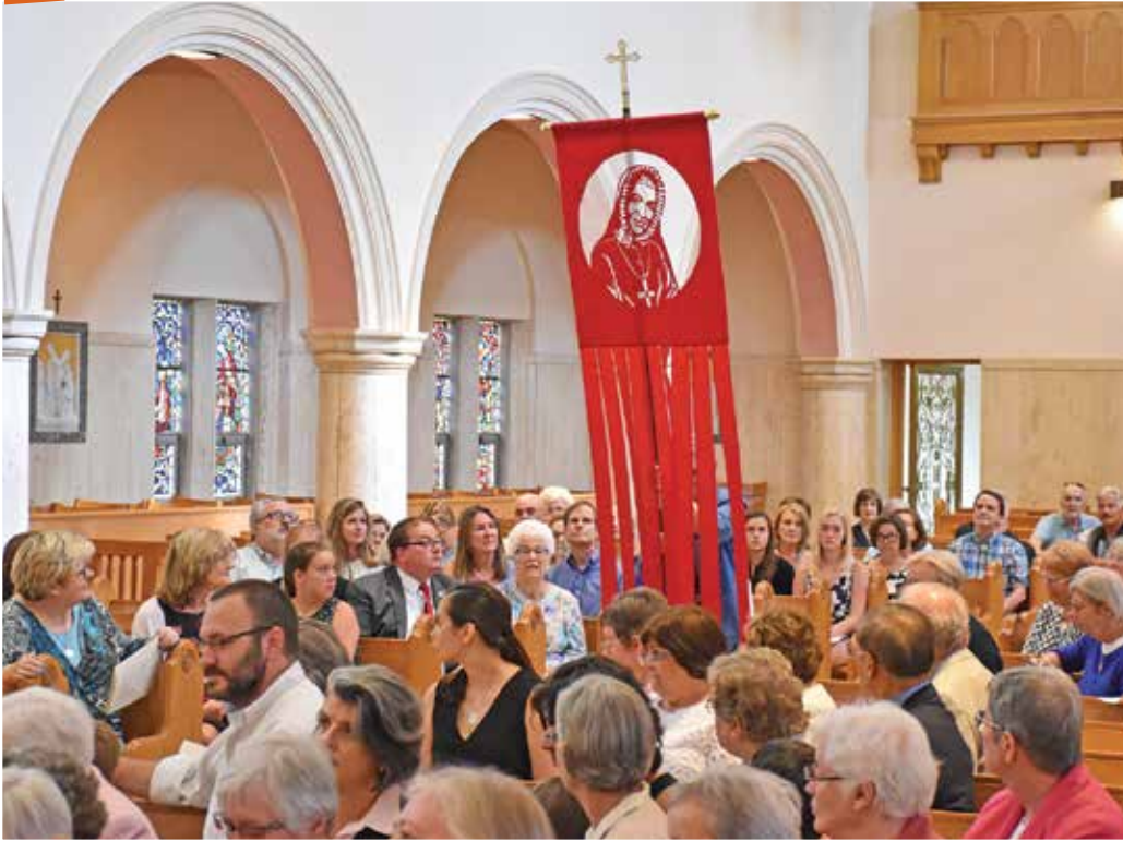
Procession for the Feast of the Sacred Heart at Villa Duchesne and Oak Hill School chapel introduced the new banner of St. Rose Philippine Duchesne to open the Bicentennial activities for the USC province.

Saint Rose Philippine Duchesne 1818-2018 200 Years CROSSING FRONTIERS