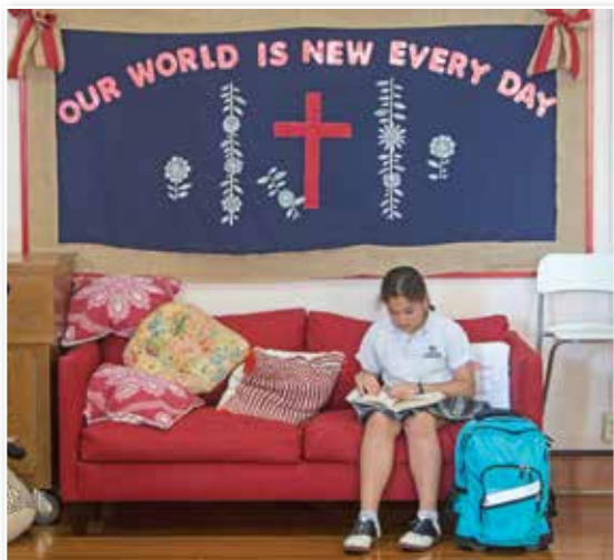
A student finds a quiet place to study at the Academy of the Sacred Heart, the Rosary, New Orleans, LA.