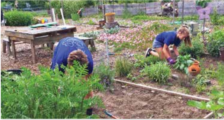
Academy of the Sacred Heart, Bloomfield Hills, MI: Students participated in the Helping Hungry Hearts Service Project focused on learning about hunger in the Detroit metro area. They volunteered at or visited organizations to help alleviate hunger and prepared and distributed lunch to children at Crossroads of Michigan in Detroit.