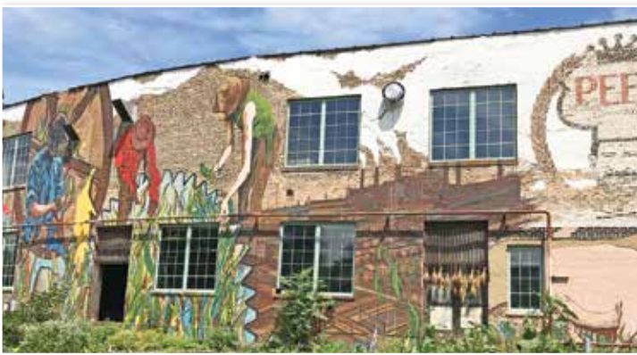
Students took a tour of The Plant, a former meat-packing plant that now houses 20 food businesses all focused on reusing waste. The tour was coordinated by Plant Chicago, the nonprofit operating out of the building. For more information on Plant Chicago programs, visit plantchicago.org .