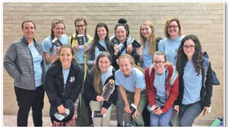
Students and faculty from Duchesne Academy, Omaha, NE, on their trip to the Dominican Republic. The Institute for Latin American Concern (founded by Creighton University) takes students to the Dominican Republic to do service and learn about life in a developing country. Each year 12 young women from Duchesne spend the fall semester raising money to do a service project in one of the campos . The spring semester is spent preparing for the trip: building community, learning about the history and current issues in the Dominican Republic, and preparing spiritually. Preparation also includes an overnight retreat. Students then spend two weeks in the Dominican Republic learning about the country firsthand and completing their service project.