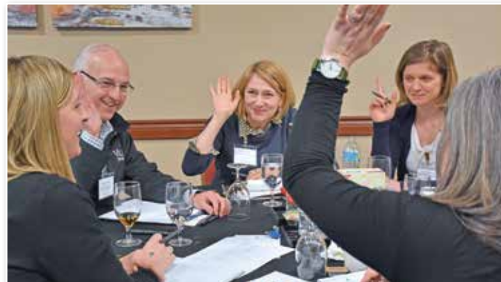
In March, the Conference of Sacred Heart Education organized a mini-conference for the communications staff members from the 24 Network Schools. With the coming of the Bicentennial, it was a wonderful time to discuss the opportunities and challenges of communicating our mission on digital platforms. There were presentations from the Conference, Network Schools, and province members and staff.