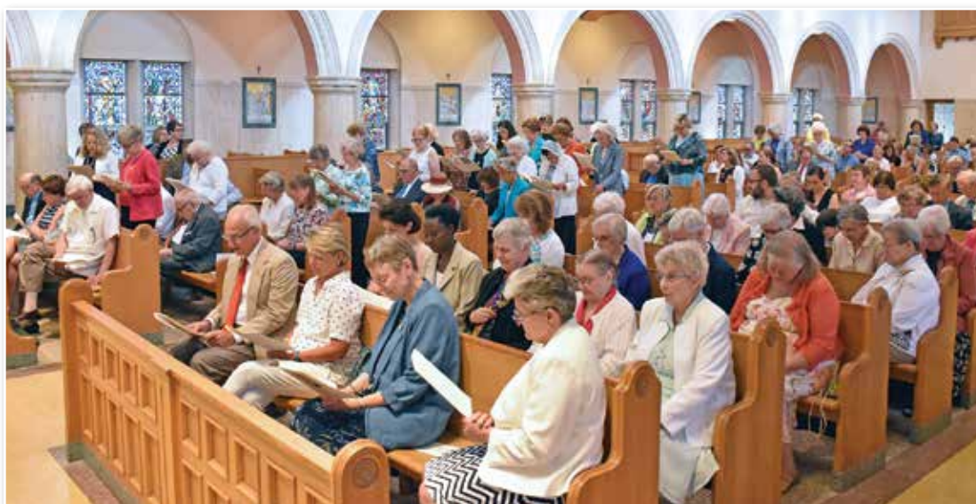
St. Louis/St. Charles Children of Mary (standing) renew their act of consecration at the Feast of the Sacred Heart, Villa Duchesne and Oak Hill School chapel, St. Louis, MO.