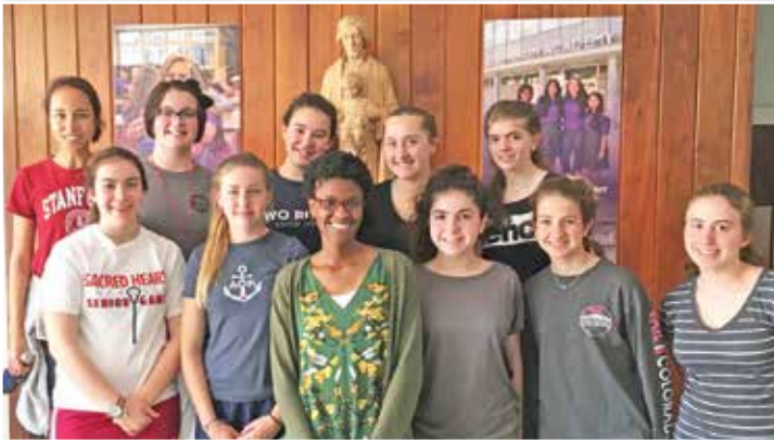
Josephinum Academy of the Sacred Heart, Chicago, IL: Almost 400,000 people in the city of Chicago lack access to fresh and healthy food. Students explored the reality, causes and methods of combating urban food deserts. They volunteered at the Greater Chicago Food Depository and a local food pantry to evaluate the quality of food available to those in need.