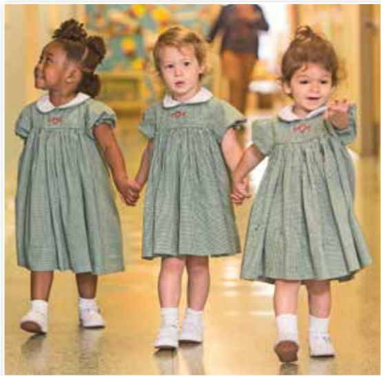
Little Hearts capture our hearts!