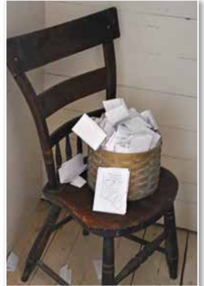
Philippine's room "under the stairs" at her shrine in Florissant, overflowing with prayer intentions

Saint Rose Philippine Duchesne 1818-2018 200 Years CROSSING FRONTIERS