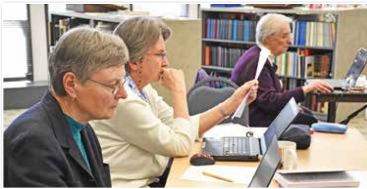
Year of Prayer committee members preparing weekly web-based reflections with the goals of: binding the Sacred Heart family together across the globe, introducing Philippine to those who don't know her and deepening the connection for those who do, considering topics significant to her story, reflecting on "frontiers" then and now, and exploring her relevance for today and for the future of the Society's mission.