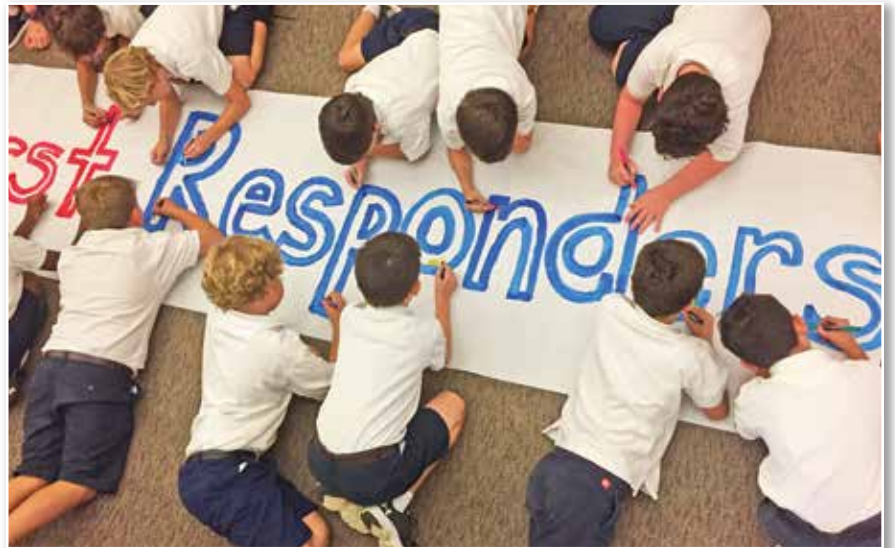
Boys from Regis School of the Sacred Heart, Houston, TX, reach out to those in need following Hurricane Harvey.