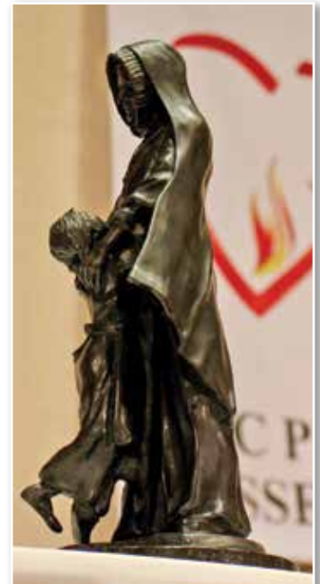
Sculpture of Saint Philippine and child