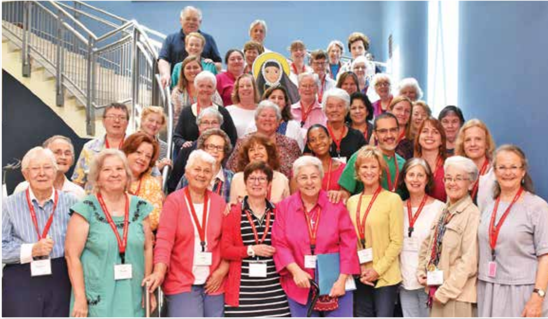
Associates from around the USC Province attended the Spirituality Forum held in St. Louis. They are pictured with RSCJ who are involved with the Associates groups.