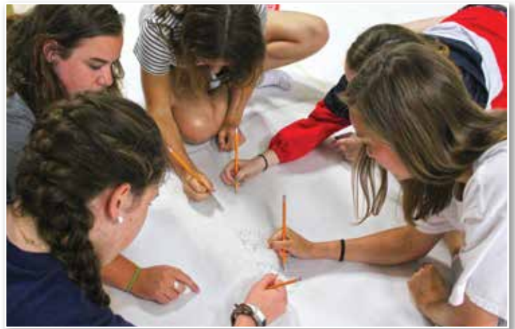
Healthy Waters Service Project participants designing a mural